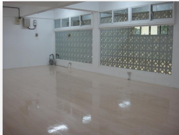
Rhythmic dance room in G3 dorm.