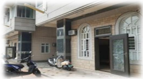
Any question living off-campus