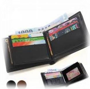
Loss of personal belongings