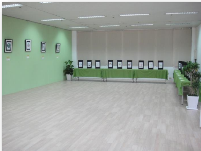
Arts space in G14 dorm.