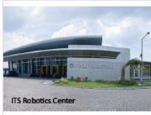
ITS Robotics Center