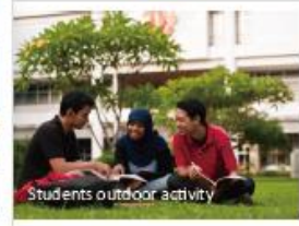
Students outdoor activity